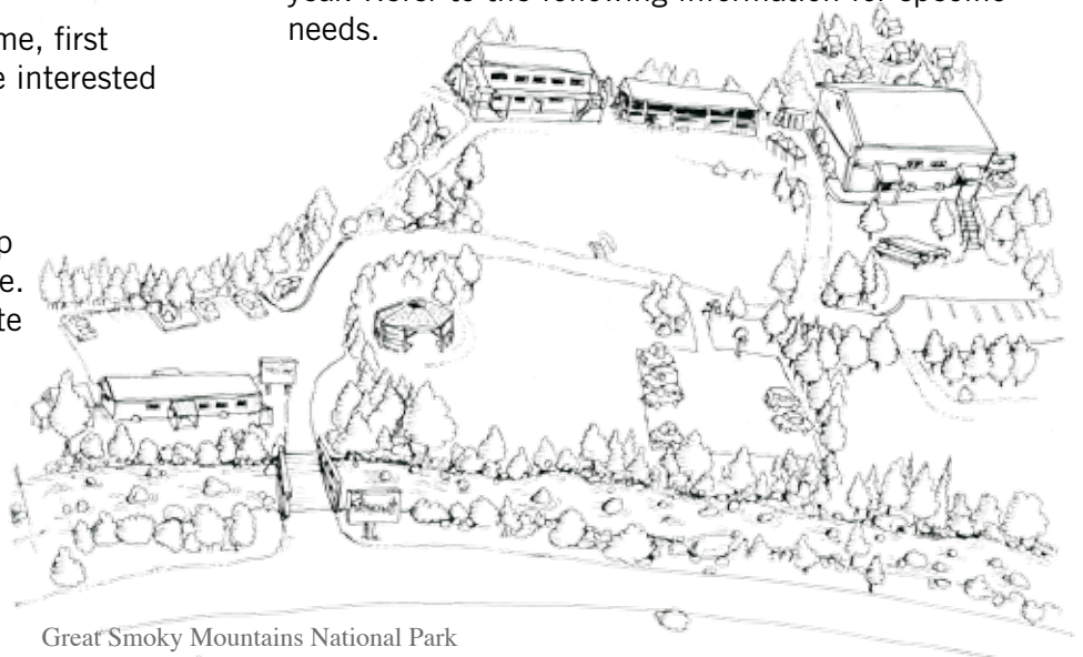
Great Smoky Mountains National Park

We will be outside for most of our sessions and will be doing some walking on and off trails. Be aware that some of the trails are steep. Please come prepared with comfortable clothes and hiking boots or good walking shoes. Please be sure to bring along rain gear as rain can be expected at any time of year. Refer to the following information for specific needs.